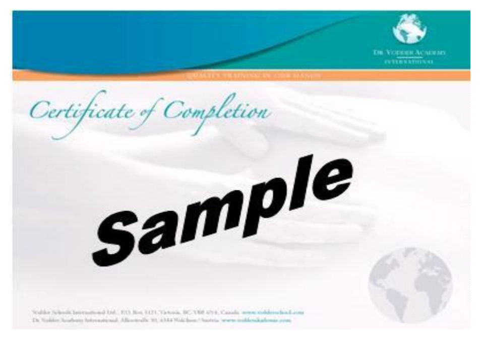
Fig. 3: Sample certificate